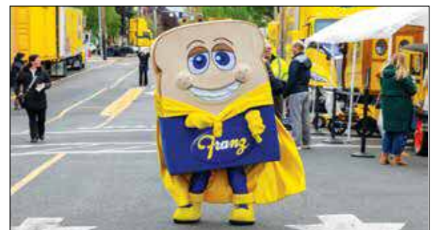
FLOUR POWER Franz Bakery celebrates 120 years of doing business in Portland. Page 16

PRESORTED STANDARD U.S. POSTAGE PAID PORTLAND, OR SIGNATURE GRAPHICS 97208