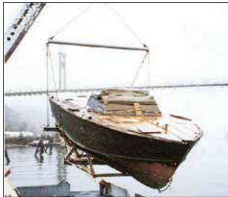
PT-658 in 1992. The boat had fallen into disrepair in San Francisco Bay. A group of veterans moved it to Swan Island and began a restoration project.