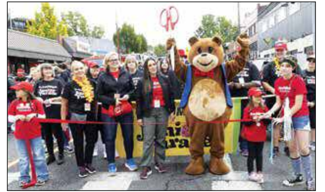
MARCHING ON Junior Parade returns to Hollywood with floats and fun — on a Saturday. Page 10