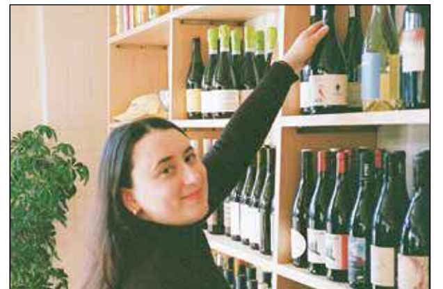
SO GOOD IT'S A SIN No Saint on NE Killingsworth has all the ingredients for a tasty good time. Page 13

New food hall and brewery opens in emerging film district. Page 5